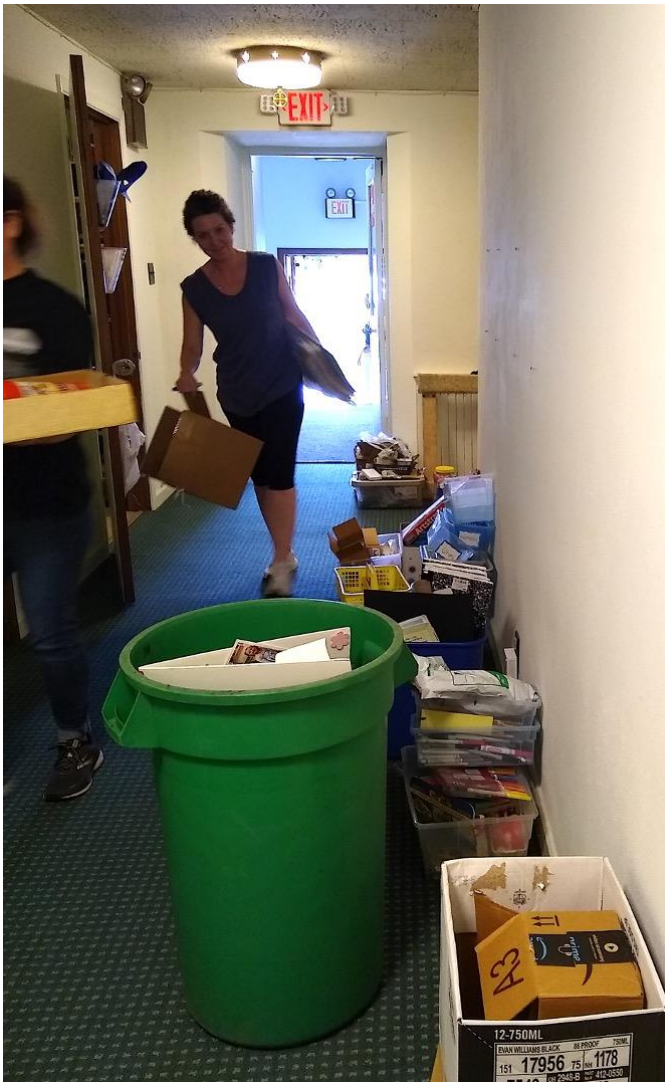
The dedicated church staff - all of us - spent time on Tuesday cleaning closets. WOW! What a difference!